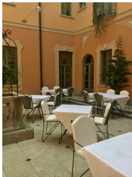
Outside restaurant room