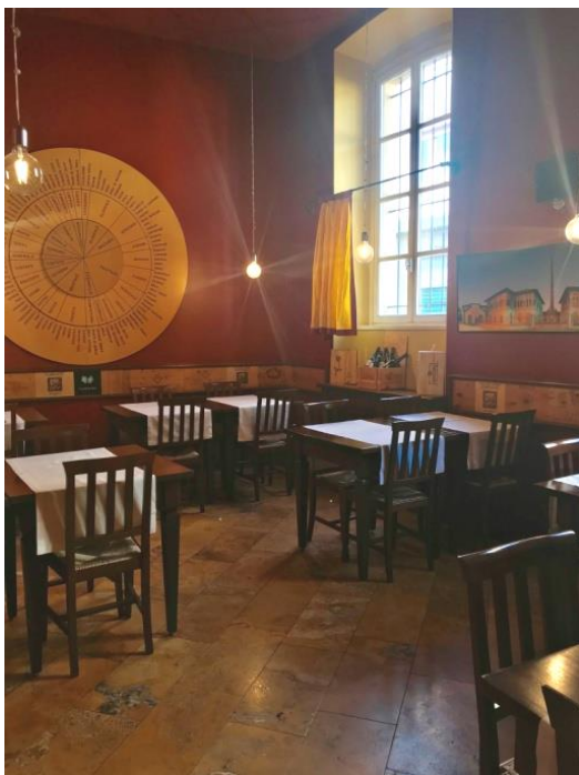
Inside restaurant room

You will also find in your room, the bar and the breakfast menus with augmentative and alternative communication symbols.